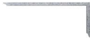
Made of stainless steel

The carpenter's square is used in the production and finishing of timber joints. Components and add-on parts can be precisely aligned. The tool is also suitable for marking out and dimensioning.