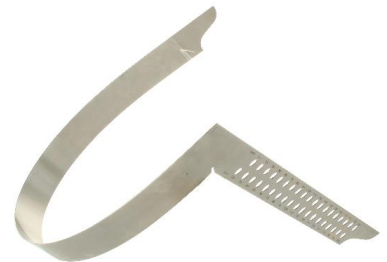
Very elastic thanks to spring steel