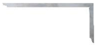
Made of stainless steel

The carpenter's square is used in the production and finishing of timber joints. Components and add-on parts can be precisely aligned. The tool is also suitable for marking out and dimensioning.