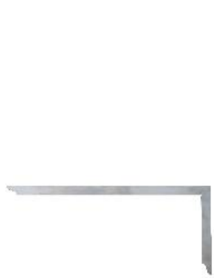
Made of stainless steel

The carpenter's square is used in the production and finishing of timber joints. Components and add-on parts can be precisely aligned. The tool is also suitable for marking out and dimensioning.