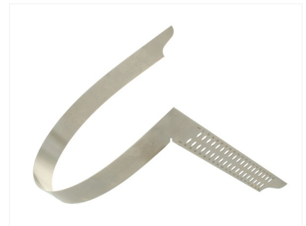
Very elastic thanks to spring steel