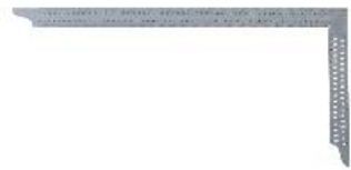
Made of stainless steel

The carpenter's square is used in the production and finishing of timber joints. Components and add-on parts can be precisely aligned. The tool is also suitable for marking out and dimensioning.