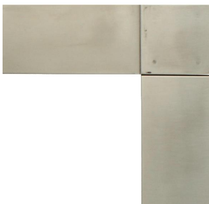
Without millimeter scale