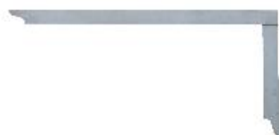
Made of stainless steel

The carpenter's square is used in the production and finishing of timber joints. Components and add-on parts can be precisely aligned. The device is also suitable for marking out and dimensioning.