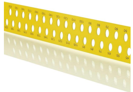
With marking holes