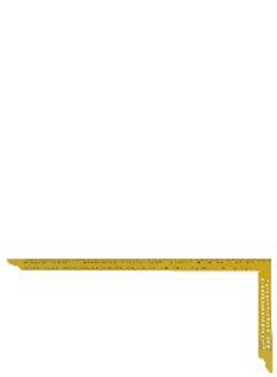
Bright yellow powder coating

The carpenter's square is used in the production and finishing of timber joints. Components and attachments can be precisely aligned. The tool is also suitable for marking out and measuring.