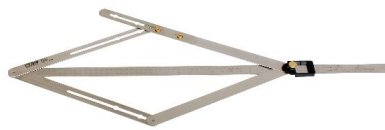
Suitable for internal and external angles