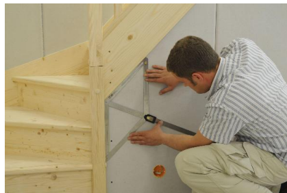
Removal and transfer of angles