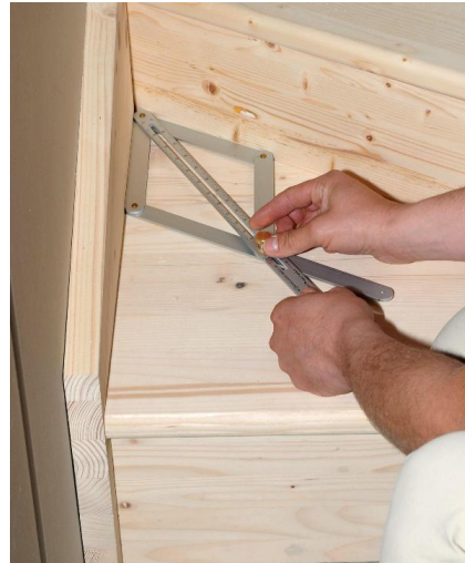
Removal and transfer of angles