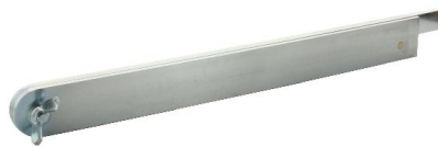
With locking screw