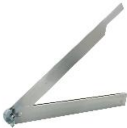
Removal and transfer of angles

The sliding bevels are made of galvanized steel. The legs can be easily fixed in place using the wing nut.