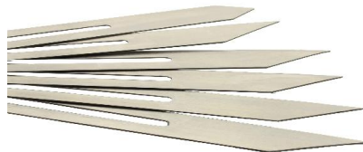
Made of hardened steel