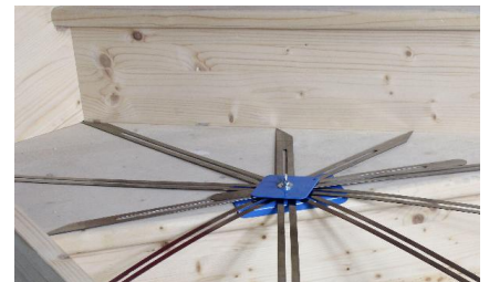
Simple scanning of the shape of steps.