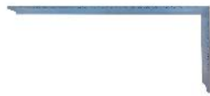
Made of stainless steel

The angles have a millimeter scale on both sides. Locks and brackets are made of high-quality stainless steel.