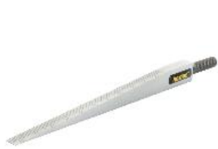
Easy inspection of unevenness and gaps

Taking photos of measurements for documentation purposes is therefore also no problem.