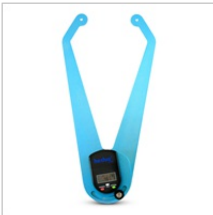
Easy to read display

A function button turns the device into a digital angle measurer with a 180° measuring range. The measured values can be read off quickly via the illuminated display. Thanks to its lightweight aluminum construction, the digital timber caliper is easy to transport and therefore the ideal helper for your measurements.