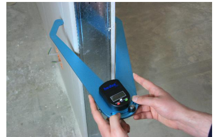
Function adjustable with just one keystroke