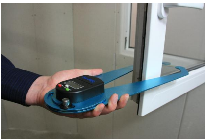
Easy gripping of door frame or window frame to determine wall thickness or glass thickness