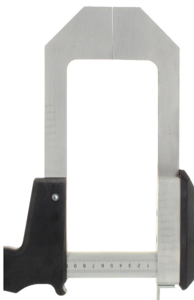
Silver anodized measuring bar