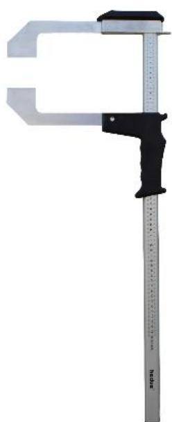
Exact measurement of wall thickness by gripping around the door chuck

Thanks to the generous projection of both measuring arms, it is even possible to reach around very wide door frames, such as in old buildings.