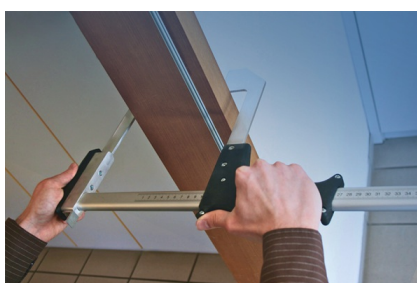
Exact measurement of wall thickness by gripping around the door chuck