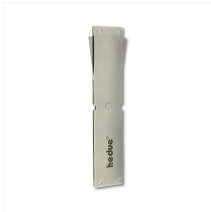
Made of stainless steel