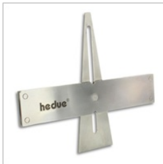
Easy scribing of dovetail and dovetail joints

The dovetail marker is the ideal tool for carpenters, restorers and trainees for easy marking of dovetail and dovetail joints. Thanks to its adjustability, the tine template is also suitable for funnel tines and can be stored in a space-saving manner.