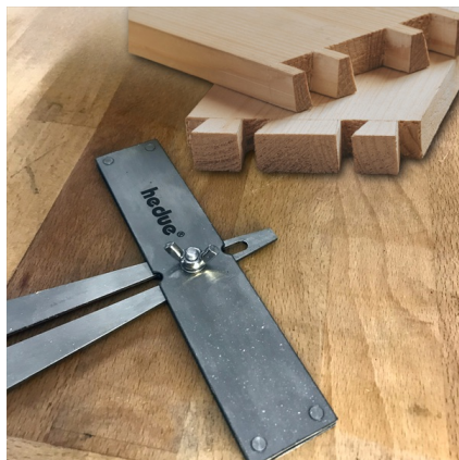
The tongue has a 1:8 inclination