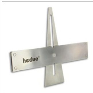
Easy scribing of dovetail and dovetail joints

The dovetail marker is the ideal tool for carpenters, restorers and trainees for easy marking of dovetail and dovetail joints. Thanks to its adjustability, the tine template is also suitable for funnel tines and can be stored in a space-saving manner.