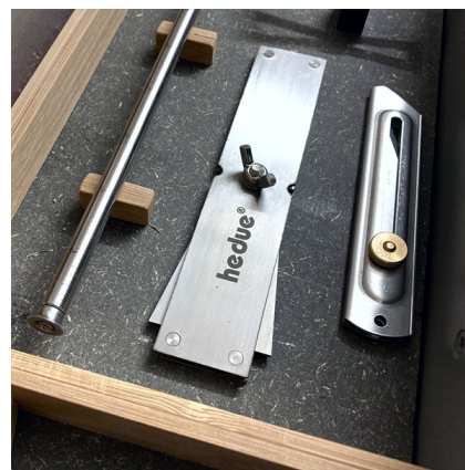
Can be rotated 90° for easy storage.