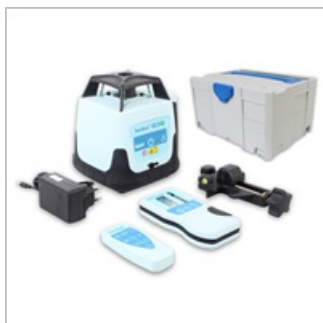
Better visualization of the laser line indoors due to the green laser diode.

This rotating laser has radically simplified operation. There are only three buttons on the construction laser itself: on/off, anti-shake and a button for selecting the laser class. Additional functions are only provided with the remote control. This makes it possible for an occasional user to leave the device without the remote control. You then have the security of knowing that the device can only be operated in self-levelling rotation. Incorrect measurements caused by incorrect operation are then ruled out.