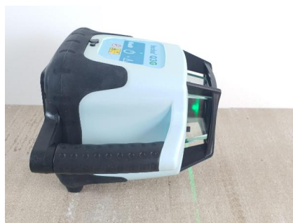
Horizontal and vertical self-levelling by servomotors up to 5° inclination.