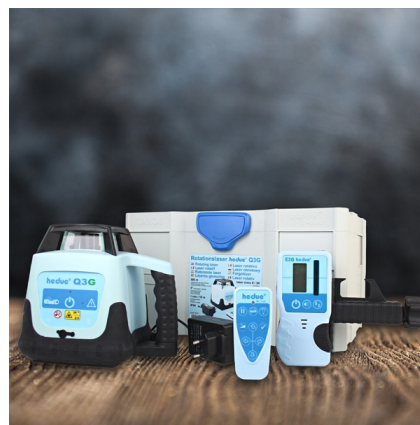
Supplied in the systainer transport and storage system. Includes laser detector with holder, remote control, charger and rechargeable battery.