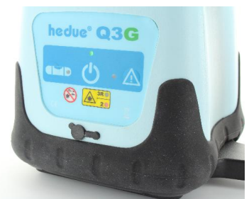
Laser class switchable between class II and 3R.