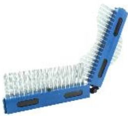
Can also be connected together at an angle

The profile scanner enables complex contours to be scanned quickly. The 20 cm long elements can be easily plugged together and adapted to individual requirements. The individual elements can also be connected to each other at an angle using the angle bracket included in the scope of delivery. Due to the flat and even support of the template, the scanned profile line can be easily transferred to other workpieces.