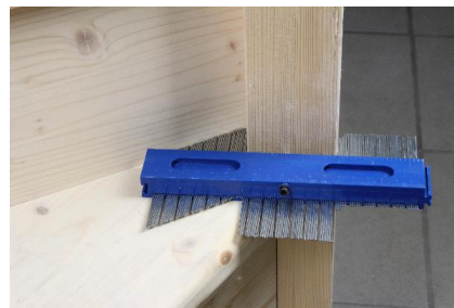
With millimeter scale