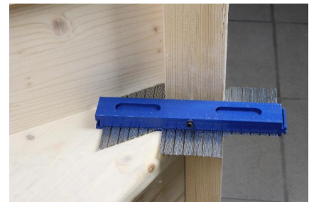
Simple scanning of complex contours