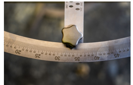
Permanently etched scaling