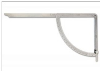
Made of stainless steel

One of the fastest marking methods is marking with the Scribing Tool Alpha, also known as the Alpha Angle. The Alpha Angle can be used for all types of joinery and has proven itself a thousand times over, both when scribing shifters, hip rafters and straight stairs, as well as when scribing single and double offsets. Positioning cradles and similar aids are no longer required.