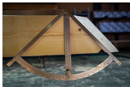
Made of stainless steel