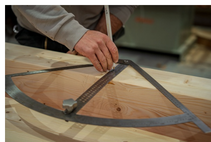
The Alpha Angle can be used for all types of joinery.