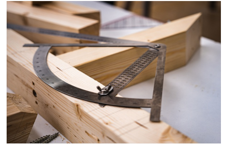
With marking holes