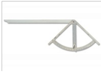
Made of stainless steel

One of the fastest marking methods is marking with the Scribing Tool Alpha, also known as the Alpha Angle. The Alpha Angle can be used for all types of joinery and has proven itself a thousand times over, both when scribing shifters, hip rafters and straight stairs, as well as when scribing single and double offsets. Positioning cradles and similar aids are no longer required.