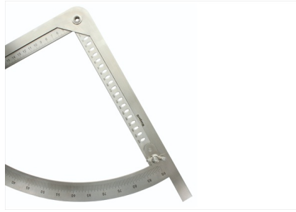
Permanently etched scaling