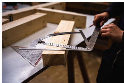
The Alpha Angle can be used for all types of joinery.