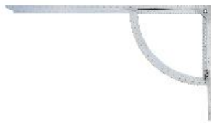
Made of stainless steel

One of the fastest marking methods is marking with the Scribing Tool Alpha, also known as the Alpha Angle. The Alpha Angle can be used for all types of joinery and has proven itself a thousand times over, both when scribing shifters, hip rafters and straight stairs, as well as when scribing single and double offsets. Positioning cradles and similar aids are no longer required.