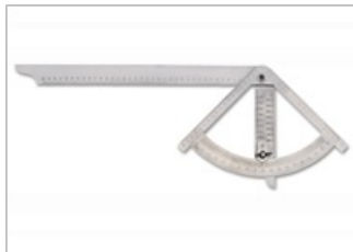
Made of stainless steel

One of the fastest marking methods is marking with the Scribing Tool Alpha, also known as the Alpha Angle. The Alpha Angle can be used for all types of joinery and has proven itself a thousand times over, both when scribing shifters, hip rafters and straight stairs, as well as when scribing single and double offsets. Positioning cradles and similar aids are no longer required.