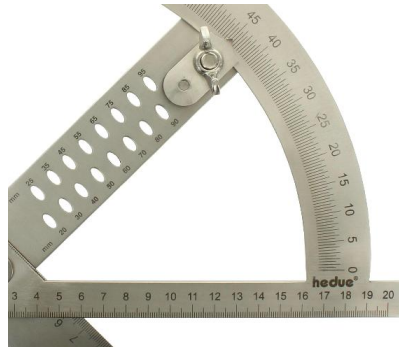
With marking holes