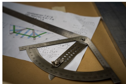
Made of stainless steel