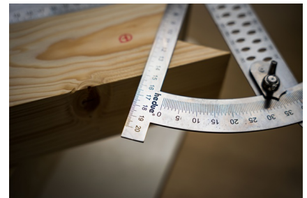
Permanently etched scaling