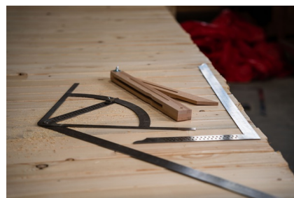
Three high quality carpenter tools in one set