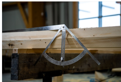
The Alpha Angle can be used for all types of joinery.