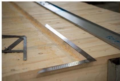
Very elastic thanks to spring steel