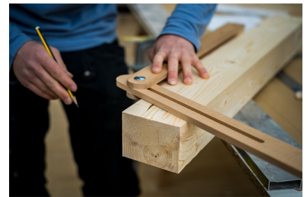
With slotted hole in the tongue