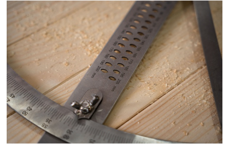
With marking holes