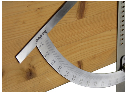
With double degree scale