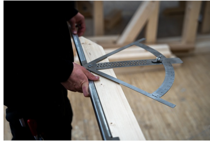
Centrally mounted quarter circle