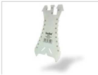
Permanently etched lettering

The quick marking tool for roofers, plumbers and tinsmiths. Easy and precise to use. This template offers 20 robust stop edges arranged at precise 5 mm intervals to give you a wide range of marking options from 5 to 100 mm. An indispensable part of your equipment.