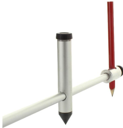
Holder for pins, scribes and snap-off knives.