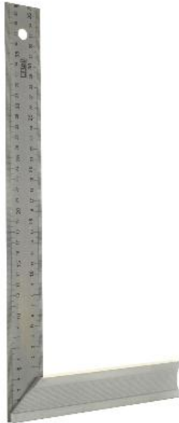
Steel tongue made of hardened stainless steel

The fluted handle is made of solid aluminum and has a 45° stop. The millimeter scale, etched on both sides, has a black background and can therefore be read clearly and without glare. The scale is abrasion-resistant and starts at zero on the outer and inner leg.