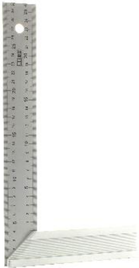
Steel tongue made of hardened stainless steel

The fluted handle is made of solid aluminum and has a 45° stop. The millimeter scale, etched on both sides, has a black background and can therefore be read clearly and without glare. The scale is abrasion-resistant and starts at zero on the outer and inner leg.