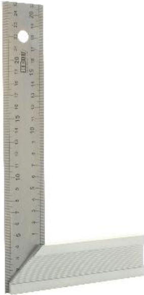
Steel tongue made of hardened stainless steel

The fluted handle is made of solid aluminum and has a 45° stop. The millimeter scale, etched on both sides, has a black background and can therefore be read clearly and without glare. The scale is abrasion-resistant and starts at zero on the outer and inner leg.