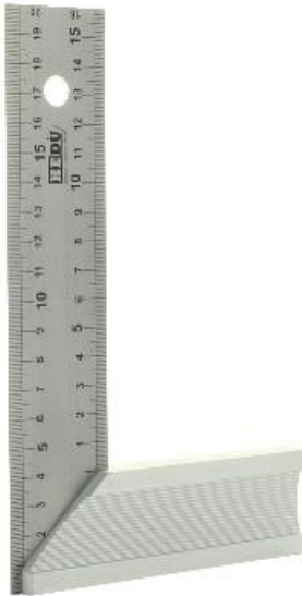
Steel tongue made of hardened stainless steel

The fluted handle is made of solid aluminum and has a 45° stop. The millimeter scale, etched on both sides, has a black background and can therefore be read clearly and without glare. The scale is abrasion-resistant and starts at zero on the outer and inner leg.