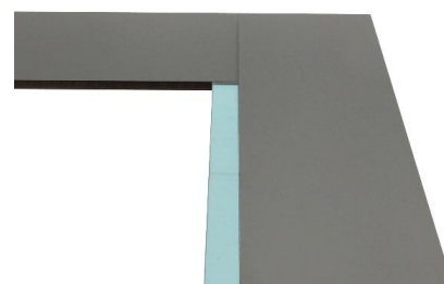
Clean and visible support through plastic spacers