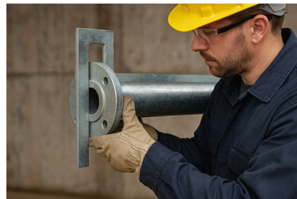
Exaktes Ausrichten von Flanschplatten am Rohrende.