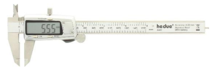
Easy to read display