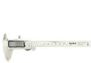
Measuring bar made of stainless steel

The unit of measurement can be adjusted at the touch of a button. The display can be set to zero in any position.