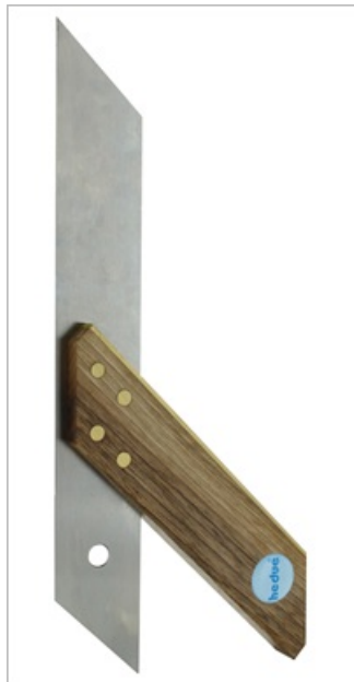
Stainless steel tongue

The mitre gauge gets its great stability from the 4-fold riveting of the blade to the leg.