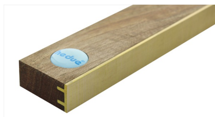
With brass fitting