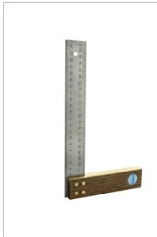
Double and double-sided millimetre scale on the steel sheet

Each angle is calibrated to an accuracy of at least 0.06°. You can obtain the calibration certificate by scanning the QR code on the bracket.