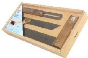
In wooden storage box

Each angle is calibrated to an accuracy of at least 0.06°. You can obtain the calibration certificate by scanning the QR code on the bracket.