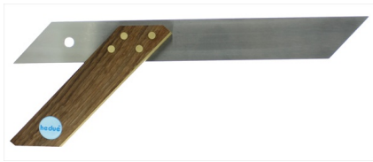
With brass fitting