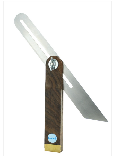
Stainless steel tongue