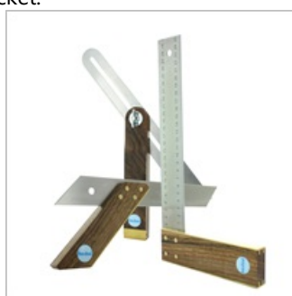
Etched, abrasion-resistant millimetre scale on both sides of the steel tongue

Each angle is calibrated to an accuracy of at least 0.06°. You can obtain the calibration certificate by scanning the QR code on the bracket.