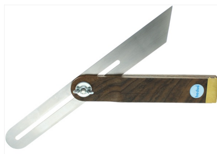
Removal and transfer of angles