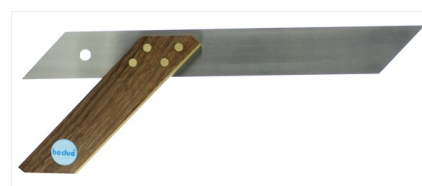
Stainless steel tongue