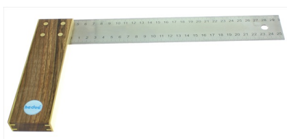
Stainless steel tongue