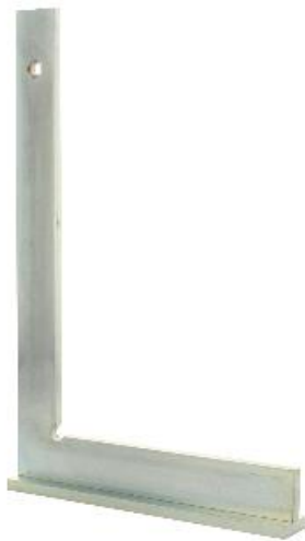
Rust protected by durable galvanization

The machinist square with base can be used to draw, check or align right angles. It is characterized by its high accuracy as well as its durable and resistant workmanship.