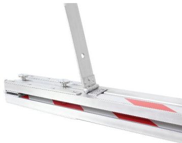
Very stable due to the hardening special alloy