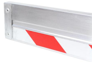
Impact protection through reinforced end caps