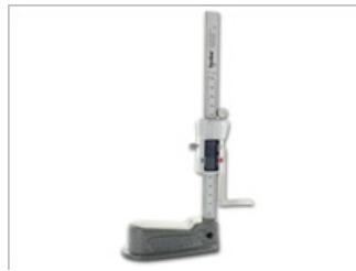
Scaled measuring bar

In addition to setting up circular saw blades or milling heads, the digital height gauge is also suitable for checking measurements of workpieces. The heavy base ensures a clean and play-free support on the machine table. The caliper can be locked in any position using the locking screw.