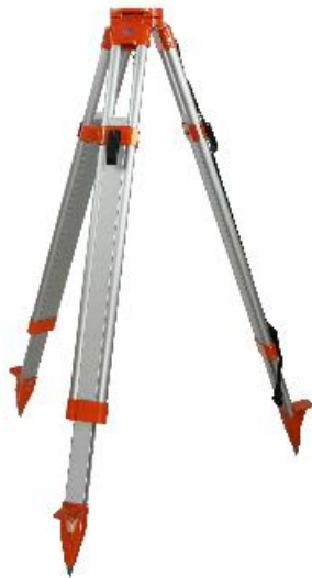
With transport lock and shoulder strap

Thanks to the flat tripod plates, the medium-weight leveling tripods are suitable for construction and surveyor's levels as well as for rotating lasers. An aperture enables the use of an optical plumb beam. The aluminum used gives the tripod a high level of robustness and weather resistance, and the tripod legs can also be positioned securely in rough terrain using the entry aid.