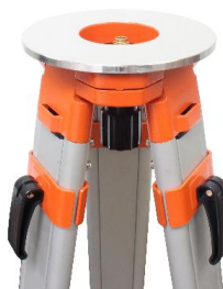
Passage for an optical plumb beam