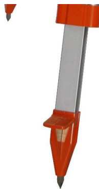
Stable positioning even in rough terrain thanks to the entry aid