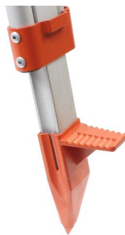
Stable positioning even in rough terrain thanks to the entry aid