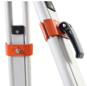
With quick clamp