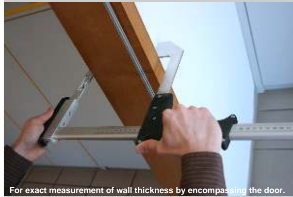
For exact measurement of wall thickness by encompassing the door.

By encompassing the door case you can easily measure the thickness of a wall. The measuring rail is silver anodized and provided with a millimetre scale on both sides. The wall measuring caliper is 60 cm long and has a measurement range of 50 cm.