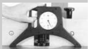
Fairs of the lower blade