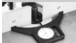
Fairs of the front blade

◆ For adjusting fastly milling machines, moulding machines ◆ Reading the measures continuously and directly ◆ Adjusting is carried out fastly at the machine standing still ◆ No sample milling necessary ◆ The danger of injury is reduced ◆ Big scale with 0,2 mm reading accuracy ◆ Scale with justification ◆ Recommended by BG Wood ◆ Measuring range 0 to 50 mm. ◆ Case made of synthetic material ◆ Mechanics made of metal ◆