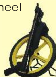
Folded only 49 cm