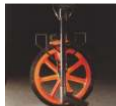
Folded only 49 cm