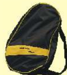
Delivery with bag

Lightweight Measuring Wheel Art.-No. E802 €69,00