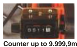
Counter up to 9.999,9m