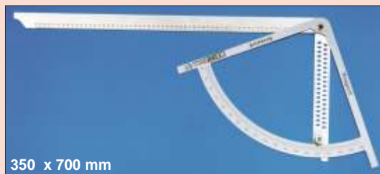
350 x 700 mm

Premium quality: all yellow marked parts are in spring steel.