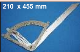
210 x 455 mm

Marking tools Alpha provides one of the quickest methods of scribing. The instrument can be used for all kinds of trimming. It is