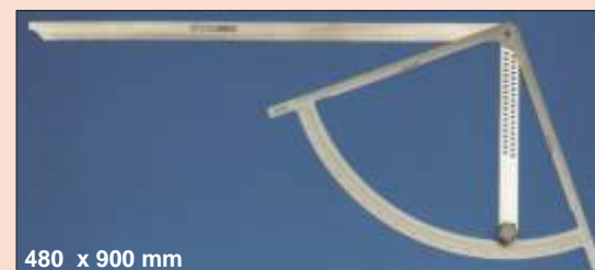
480 x 900 mm

Alpha Maxi: 1/4° graduated scale and a large star knob for locking position, millimetre graduation