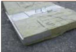
Millimeter scale on the length

For exactly and economic cutting of insulating material