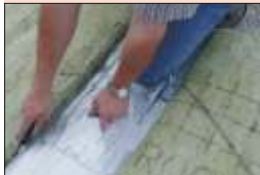
Stabile cutting edge