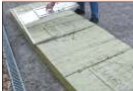
Moving without new adjustment