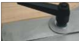
Big clamping lever

With a length of 69 cm and a weight of 3 kg this protractor really has an extremely robust finish. The measuring range reaches from 0° up to 165° with scale graduations of 0.5°. This also enables the easy readability of 1/2°, for the distance between the grading lines is nearly 1 mm. The measuring blade can be tightened by means of the large clamping lever.