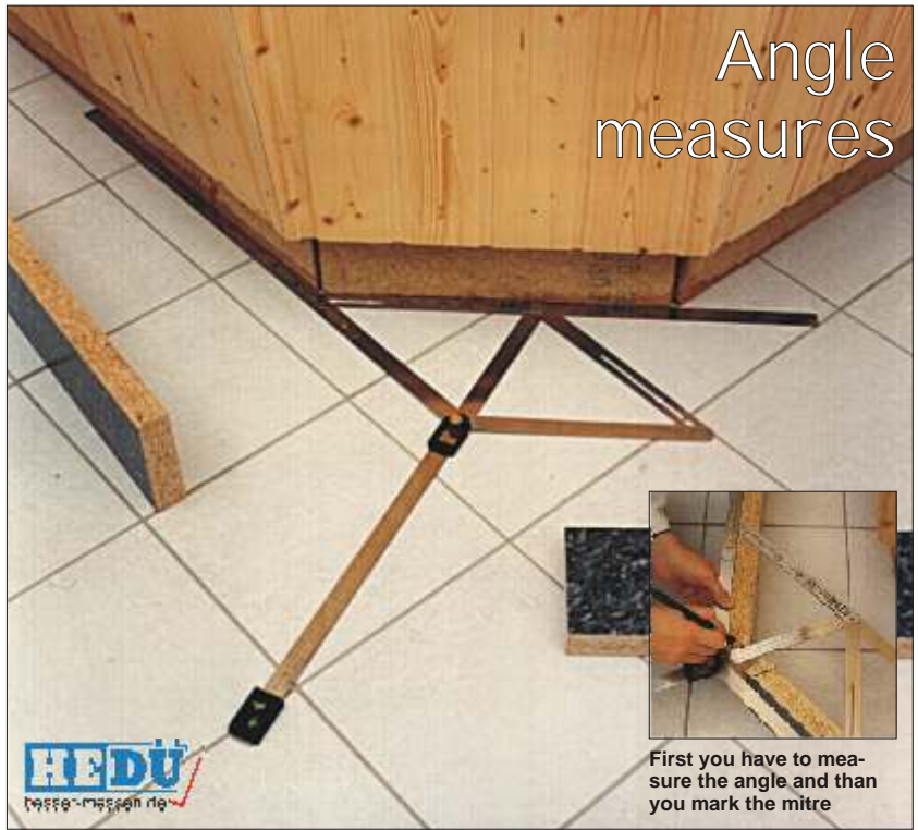
First you have to measure the angle and then you mark the mitre

the horizontal or vertical to make sure that the recorded angles for scribing are correct. Included in the delivery are two extensions to lengthen the blades to 900 mm. This high-quality,