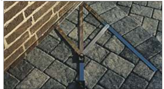
Included in the delivery are two extensions to lengthen the blades to 900 mm.

stainless steel all-round tool is suitable for virtually all conceivable uses in the workshop or on the building site. For better protection and to keep everything ready to hand the "angle pro" comes in a handy case made of durable artificial leather.